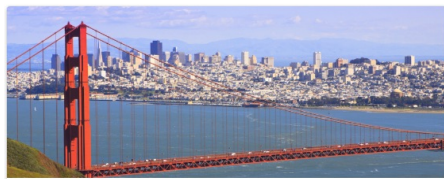
San Francisco Feb 26 - Mar 2, 2018

Copenhagen is currently the only location outside the US where Baymard Institute offers the E-Commerce UX Training workshop and certification in 2018. With direct flights from almost all of Europe it's no more than a few hours away. If that doesn't fit we have 3 other options: