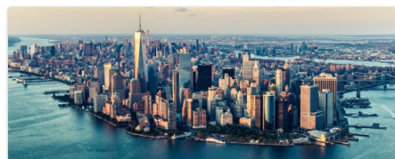
New York City March 19-23, 2018

In-house workshops: Baymard also offers in-house UX training workshops held at your company offices (anywhere in the world), only for your team , and at a date that suits you. In-house workshops are good if you want something private, and are cheaper if there's value in 5+ employees attending a Baymard workshop.